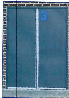
Exterior door with number on door