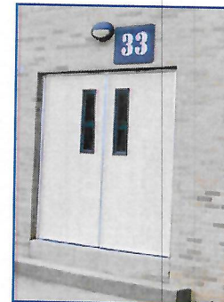
Exterior door with number on building